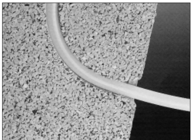
Floor heating panel containing recycled polyurethane produced by adhesive pressing.